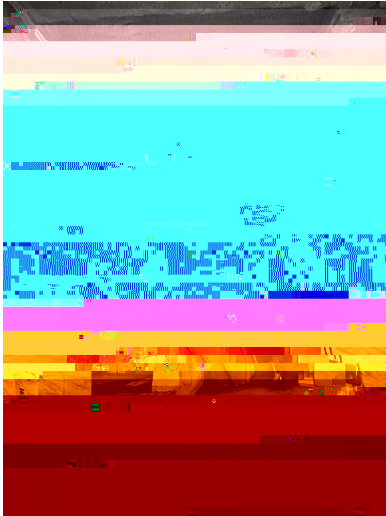
Medium Venue gallery CMU walls complete.