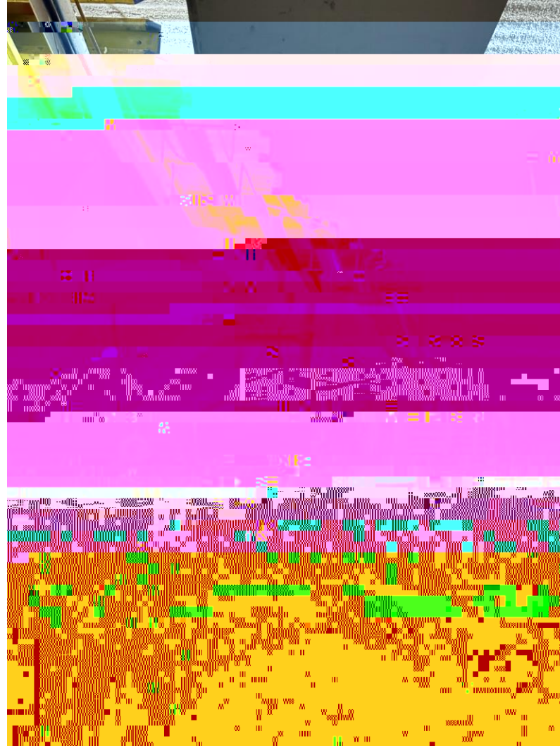
Ductwork installation has started on Floor 2