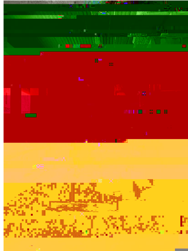
CMU block wall installation ongoing throughout.